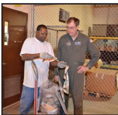
TAC Enterprises tour