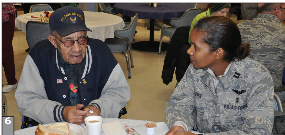
6. Airmen of the 445th Airlift Wing ended the year by attending the annual VA Christmas party Dec. 3, providing lunch, gifts and companionship to local Dayton VA Medical Center residents.