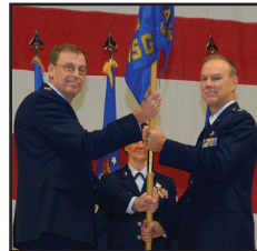
MSG appointment of command