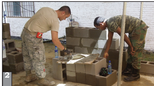
2. During the summer, 445th Civil Engineer Squadron reservists participated in New Horizons, a cooperative humanitarian training exercise between the Suriname government and the U.S. Southern Command, with the goal of helping to improve the quality of life for the people of Suriname.