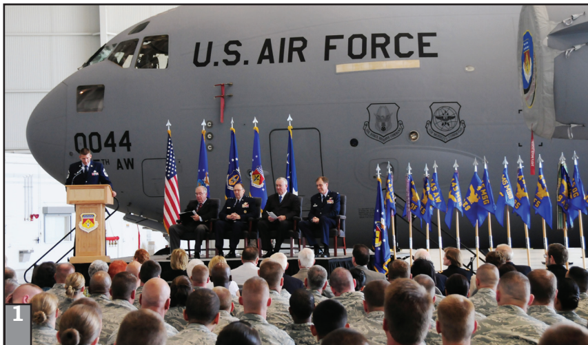
1. More than 600 Airmen and community leaders attended the 445th Airlift Wing's C-17 Welcome Ceremony July 9.