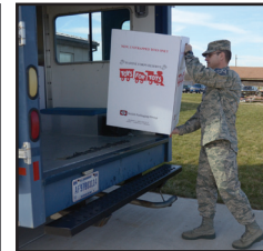
Toys for Tots

445TH AIRLIFT WING/PA BUILDING 4014, ROOM 113 5439 MCCORMICK AVE WRIGHT-PATTERSON AFB OHIO 45433-5132