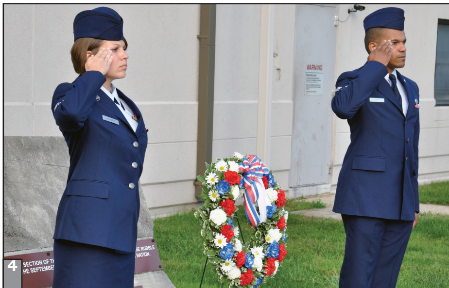
4. More than 200 Airmen observed the 9/11 tragedy in a remembrance ceremony Sept. 11.