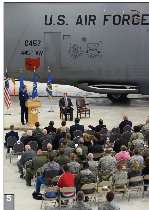
5. A C-5 farewell ceremony was held Oct. 14 to mark the end of the C-5 era that began here in Oct. 2005.